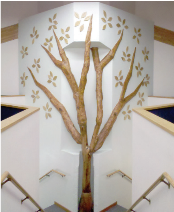
Four Seasons Conference Center Tree of Blessings

Thanks to friends like you, the tree continues to grow!